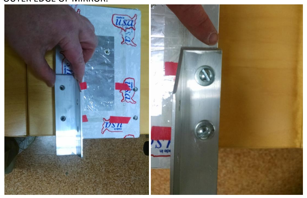
7) JOIN FRONT MIRROR WITH BACK MIRROR, BE SURE THAT BRACKET SLIDES OVER THE STAND ANGLE

6) USING THE 2<sup>ND</sup> MIRROR, ATTACH THE BRACKET THE SAME WAY WITH THE ANGLE ALONG OUTER EDGE OF MIRROR.