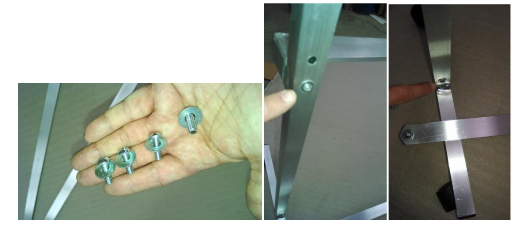
4) After all 4 screws are in place, put stand upright on floor and tighten all screws.

3) Attach crossbrace with \frac{1}{2} " roundhead screws into threaded inserts on T-stands.