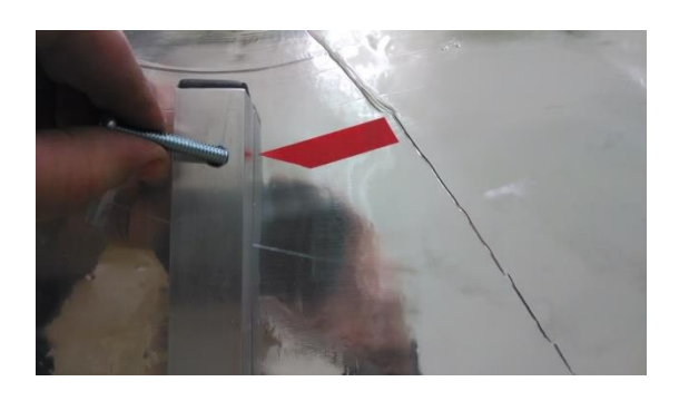
13) LOCATE HOLE IN BUMPER BAR CENTER, USE DRILL TO INSTALL SEILF DRILLING SCREW. BE SURE PLASTIC COVER IS NOT TRAPPED