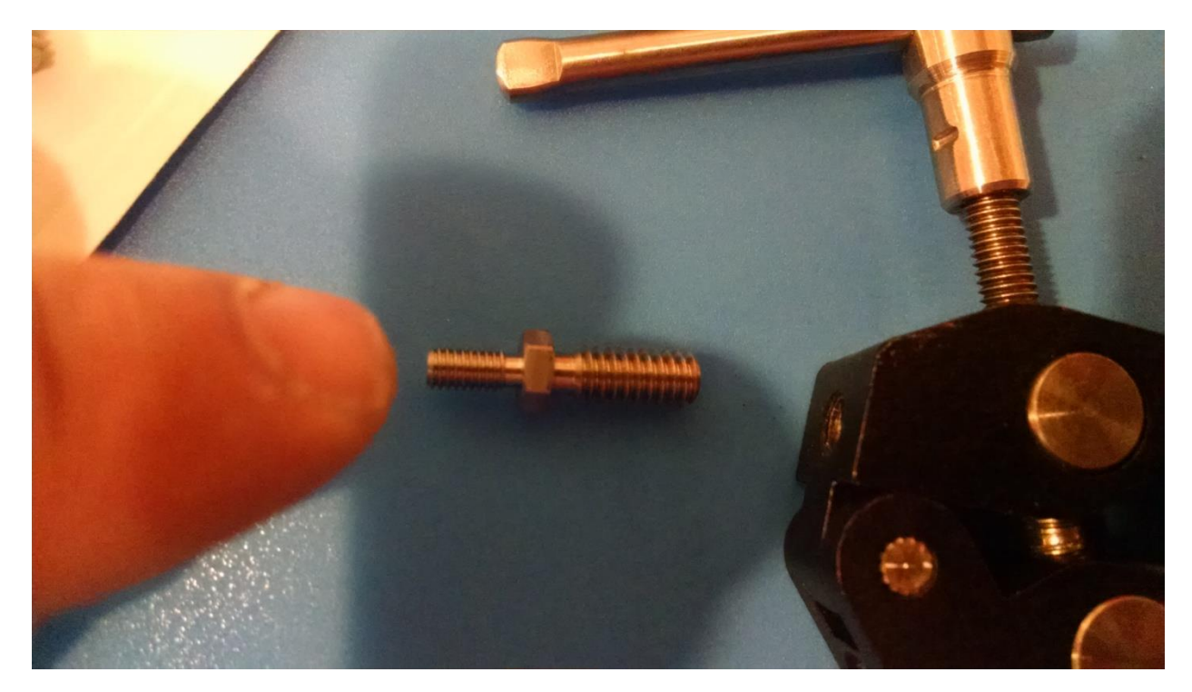
4) GENTLY TIGHTEN WITH ADJUSTABLE OR 5/16" WRENCH

3) SCREW IN ¼-20 SIDE OF ADAPTER INTO CLAMPS