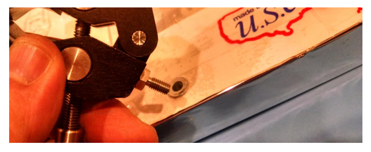
6) AFTER THREAD HAS REACHED BOTTOM, BACK-UP CLAMP UNTIL IS PARALLEL WITH MIRROR SIDE.

5) SCREW CLAMP AND STUD ASSEMBLY INTO BACK OF MIRROR PANEL